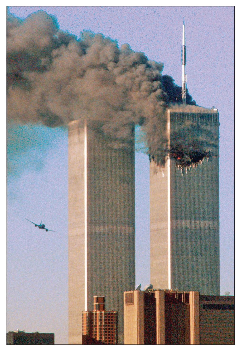
Hijacked United Airlines Flight 175 flies toward the World Trade Center twin towers before slamming into the south tower as the north one burns in the Sept. 11, 2001, attacks.

'We didn't know what to think," Noone said. "We didn't know what to do. We were just frozen. What was going to happen next? Should we be here?