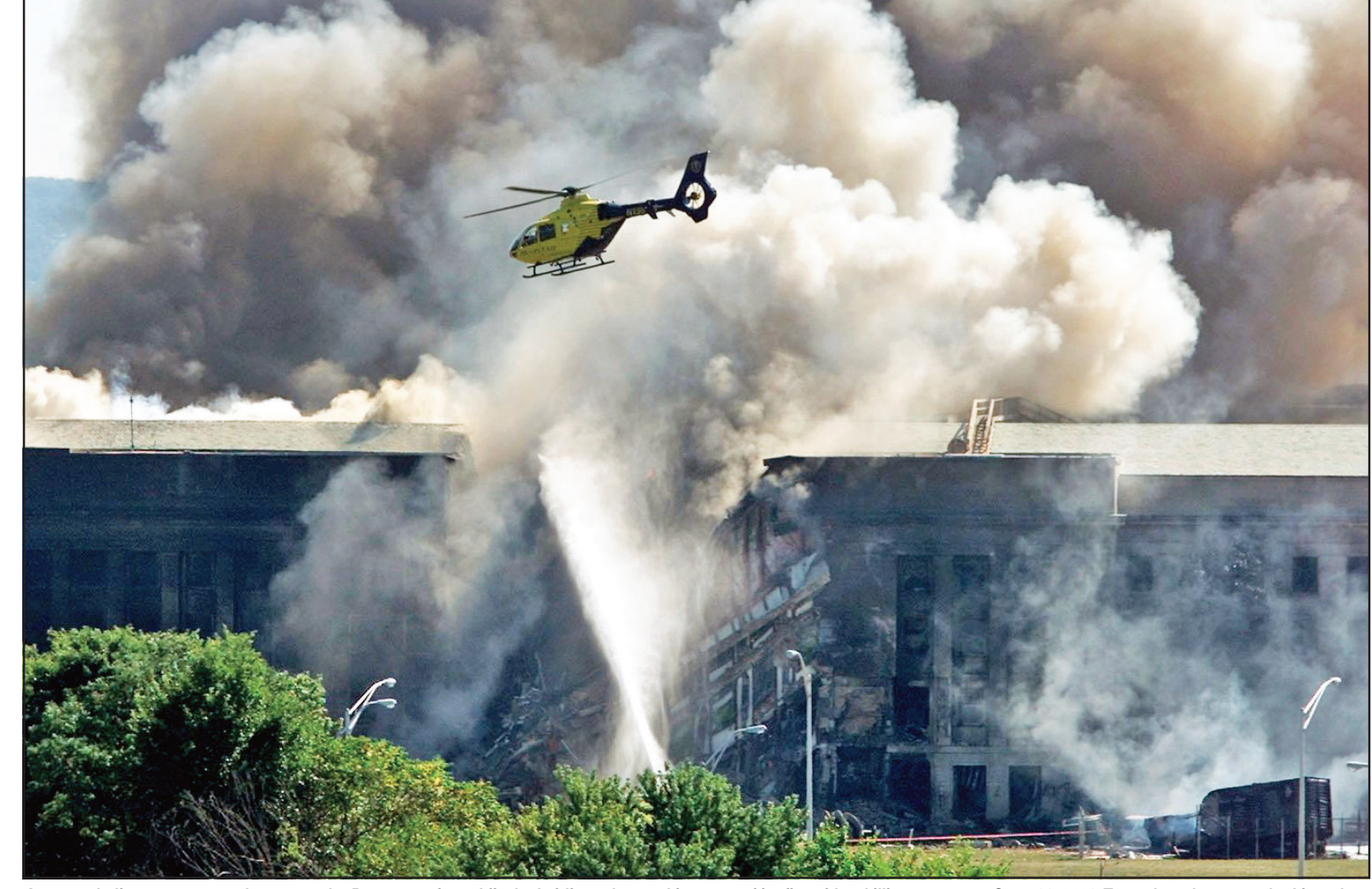
A rescue helicopter surveys damage to the Pentagon after a hijacked airliner slammed into one of its five sides, killing scores on Sept. 11, 2001. Two other planes crashed into the World Trade Center and one crashed in Pennsylvania.