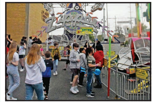
People walk by rides on May 15 at the St. Joseph Parish Festival in Shelbyville.

St. Mark the Evangelist Parish, 535 Edgewood Ave., Indianapolis. FunFest, Thurs. 6-11 p.m., Fri. and Sat. 5 p.m.-midnight, amusement rides, children's