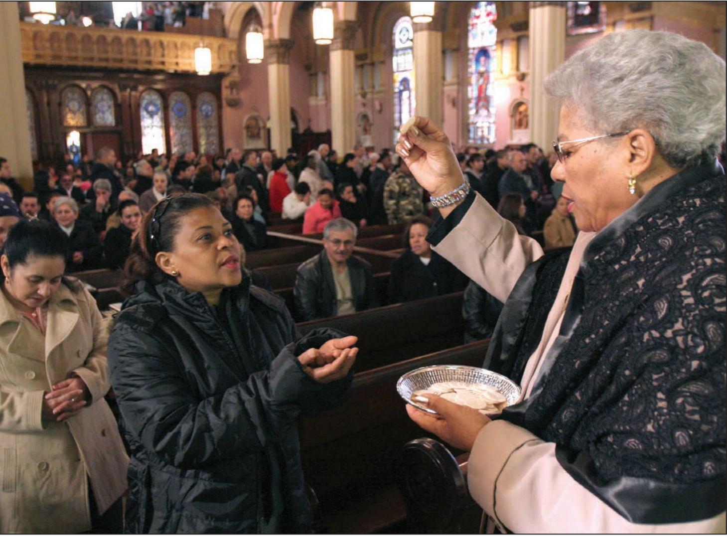
An extraordinary minister of holy Communion distributes Communion during Mass. Worshipers participate in the Mass through verbal responses and singing. Some participate by proclaiming the Scripture readings, distributing Communion and in roles meant to assure that newcomers and others feel welcome.

'Vatican II ... fostered liturgical participation through its