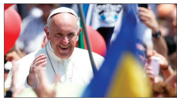
Pope Francis greets the crowd after celebrating Mass marking the feast of Pentecost in St. Peter's Square at the Vatican on June 4. In attendance were thousands of people celebrating the 50th anniversary of the Catholic charismatic renewal.

"When this happens," the pope said, "we choose the part over