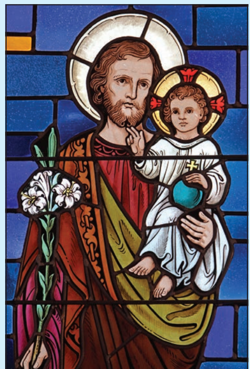
St. Joseph and the infant Jesus are depicted in a stained-glass window at the St. Joseph Home for the Aged in Huntington, N.Y. Humility is a prime virtue in how Joseph lived out his calling as a father.