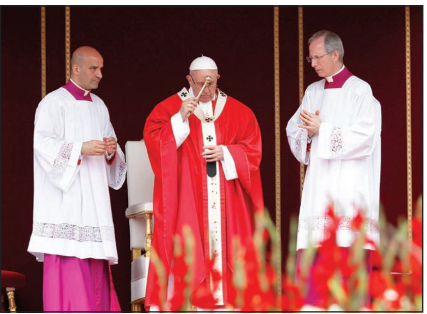
Pope Francis blesses himself with holy water as he celebrates Mass marking the feast of Pentecost in St. Peter's Square at the Vatican on June 4. In attendance were thousands of people celebrating the 50th anniversary of the start of the Catholic charismatic renewal.