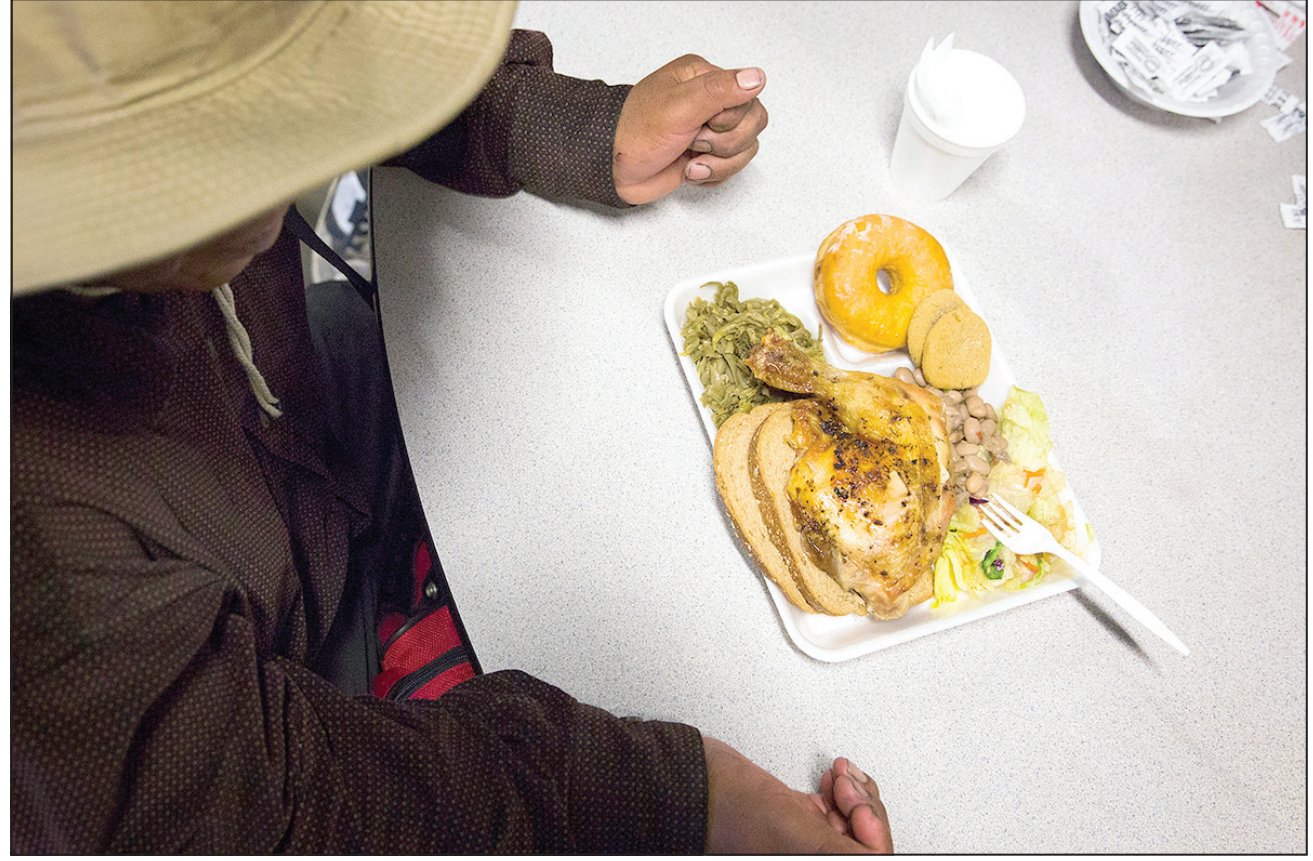
A man sits down to a meal at the St. Vincent de Paul Society dining room in Phoenix in this 2016 photo. Food connects us to our beliefs, our communities and our ancestors.

Although we must eat, we also must try to avert our gaze from the constant barrage of food messaging,