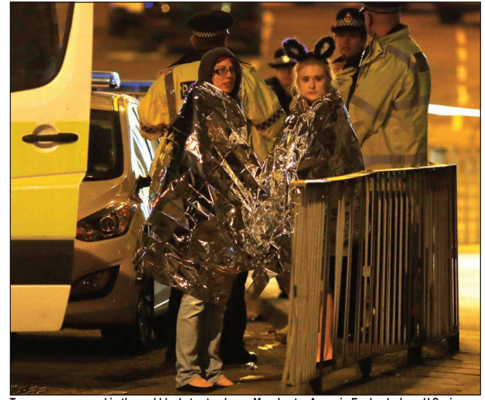
Two women wrapped in thermal blankets stand near Manchester Arena in England where U.S. singer Ariana Grande had been performing on May 22. At least 22 people, including children, were killed and dozens wounded after an explosion at the concert venue. Authorities said it was Britain's deadliest case of terrorism since 2005.