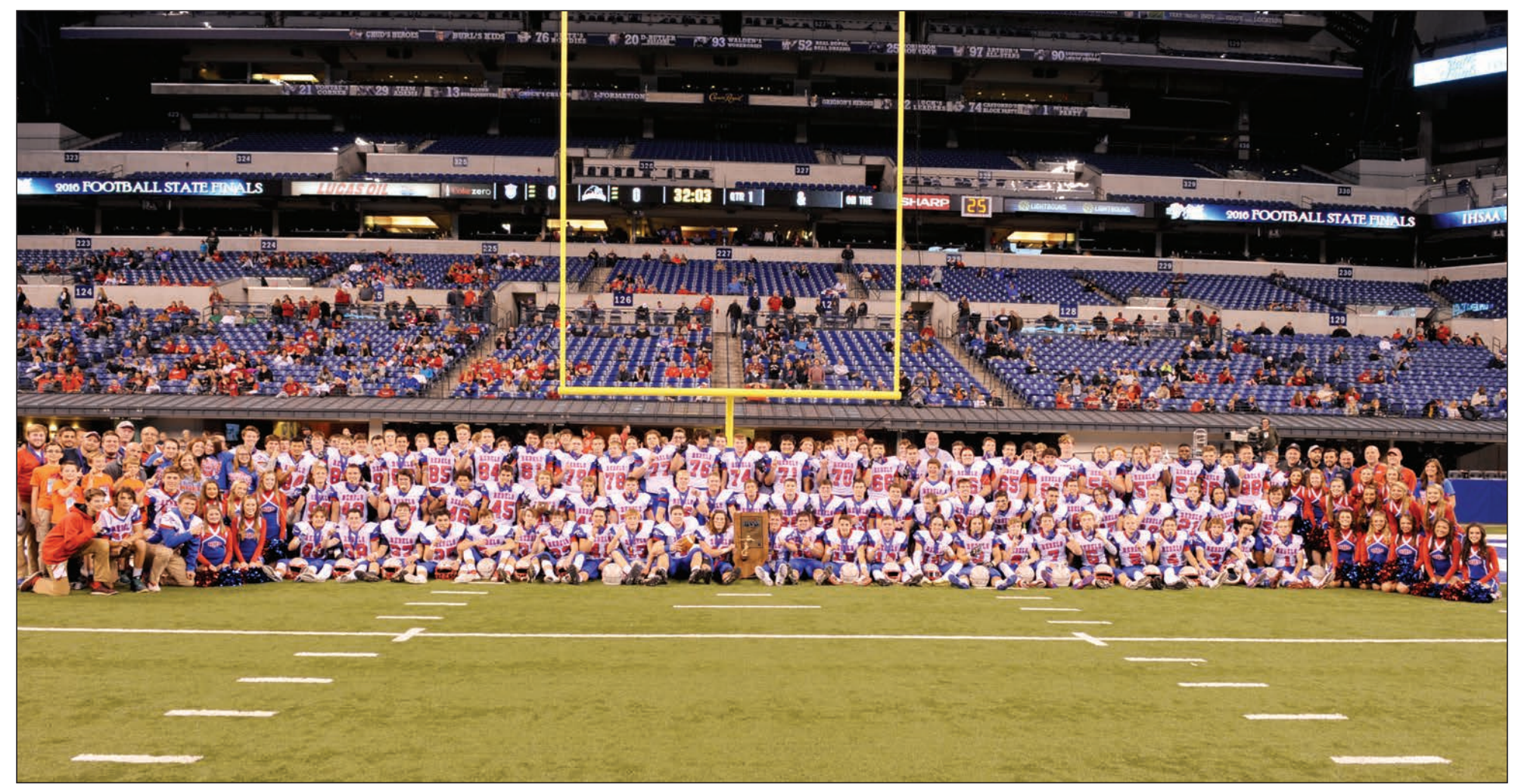
The football team of Roncalli High School in Indianapolis is pictured on Nov. 25 in Lucas Oil Stadium in Indianapolis after winning the Indiana class 4A state football championship.