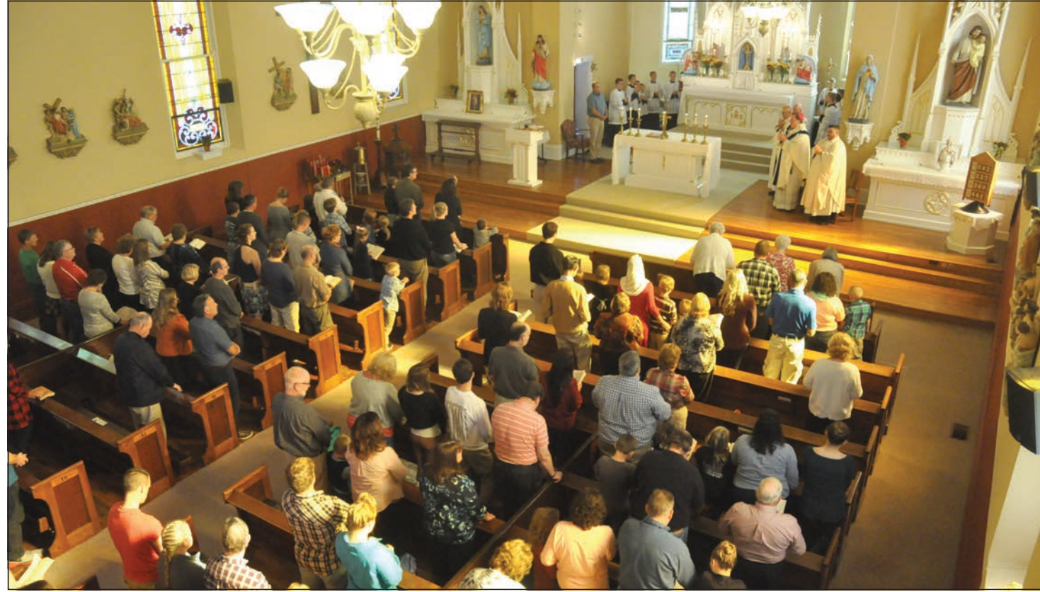
Some 200 worshippers fill St. Anne Church in Jennings County for a Nov. 6 Mass that celebrated the 175th anniversary of the founding of the Seymour Deanery faith community.

community. Everyone knows each other. It's basically an extended family.'