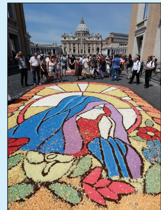
A floral rendition of Mary decorates the area outside St. Peter's Square at the Vatican on June 29. The words of the archangel Gabriel, spoken to Mary in the Gospel of St. Luke (1:37), are followed by the most faith-filled response in all of Scripture: "May it be done to me according to your word."