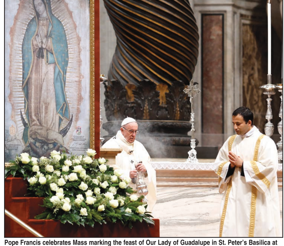
the Vatican on Dec. 12.

"Let us not be afraid to go out and look upon others with the same gaze, a gaze that makes us brothers and sisters." †