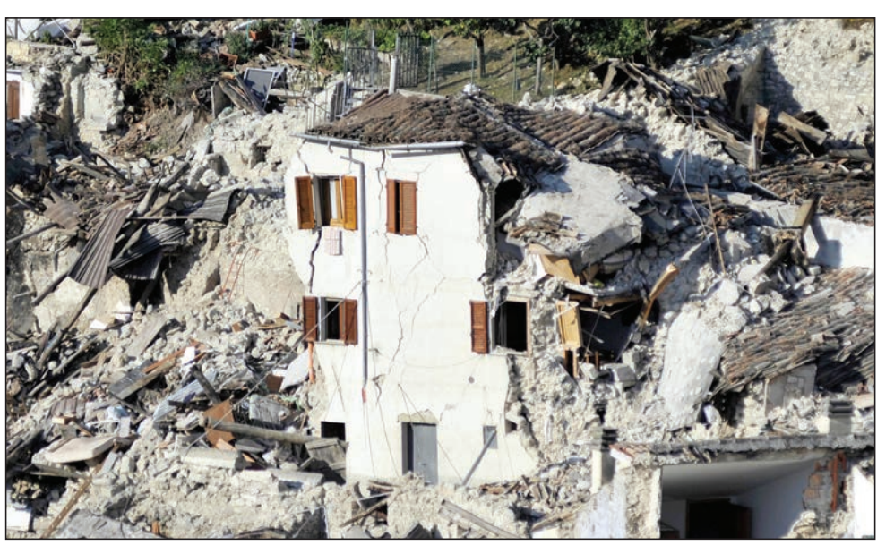
Destroyed homes are seen on Aug. 26 in Pescara del Tronto, Italy. Pope Francis said he will visit survivors of the Aug. 24 quake "as soon as possible." The 6.2 earthquake left hundreds dead and thousands homeless.