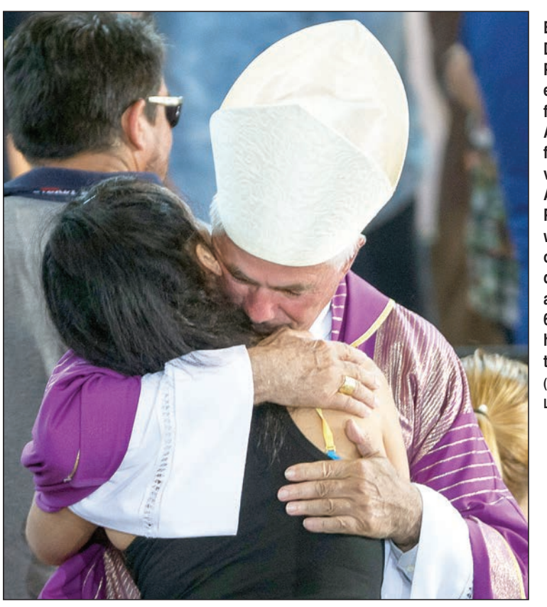
Bishop Giovanni D'Ercole of Ascoli Piceno, Italy, embraces a woman following an Aug. 27 mass funeral for earthquake victims at a gym in Ascoli Piceno, Italy. Pope Francis said he would visit survivors of the Aug. 24 quake "as soon as possible." The 6.2 earthquake left hundreds dead and thousands homeless.

Bishop Giovanni D'Ercole of Ascoli Piceno led a state funeral for victims on Aug. 27 inside a gymnasium. More than 2,000 people attended, including Italian President Sergio Mattarella and Prime Minister Matteo Renzi. Set before the altar were dozens of caskets covered with flowers and photos of lost loved ones, as well as two small white caskets representing all the children killed in the