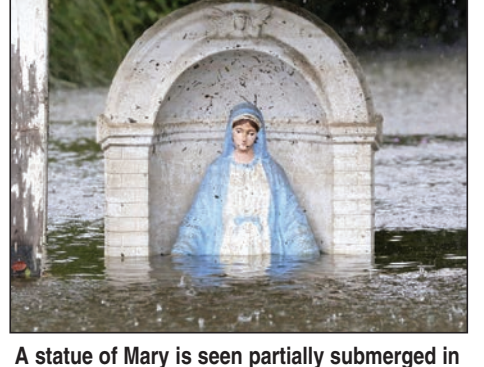
flood water in Sorrento, La., on Aug. 20.

The Mass of Thanksgiving for the Canonization of St. Teresa of Calcutta will be celebrated at SS. Peter and Paul Cathedral in Indianapolis at 5:15 p.m. rather than 5 p.m. as listed in the Aug. 26 issue of The Criterion. †