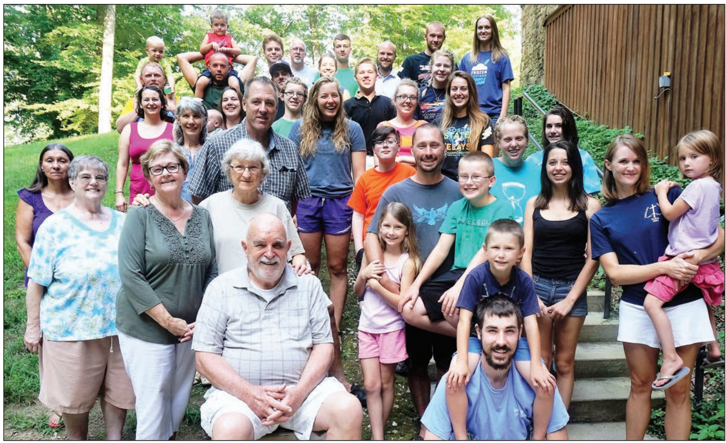
Teenagers and youth ministry leaders from St. Agnes Parish in Nashville and parishes in Terre Haute spent four days in late July assisting people in need in Brown County.

This year's team consisted of five youths from St. Agnes Parish. Six youths also came from the Terre Haute youth ministry program, representing the parishes of St. Benedict, Sacred Heart of Jesus, St. Patrick, St. Margaret Mary and St. Joseph University. Seventeen adults, many of whom return each year, also volunteered.