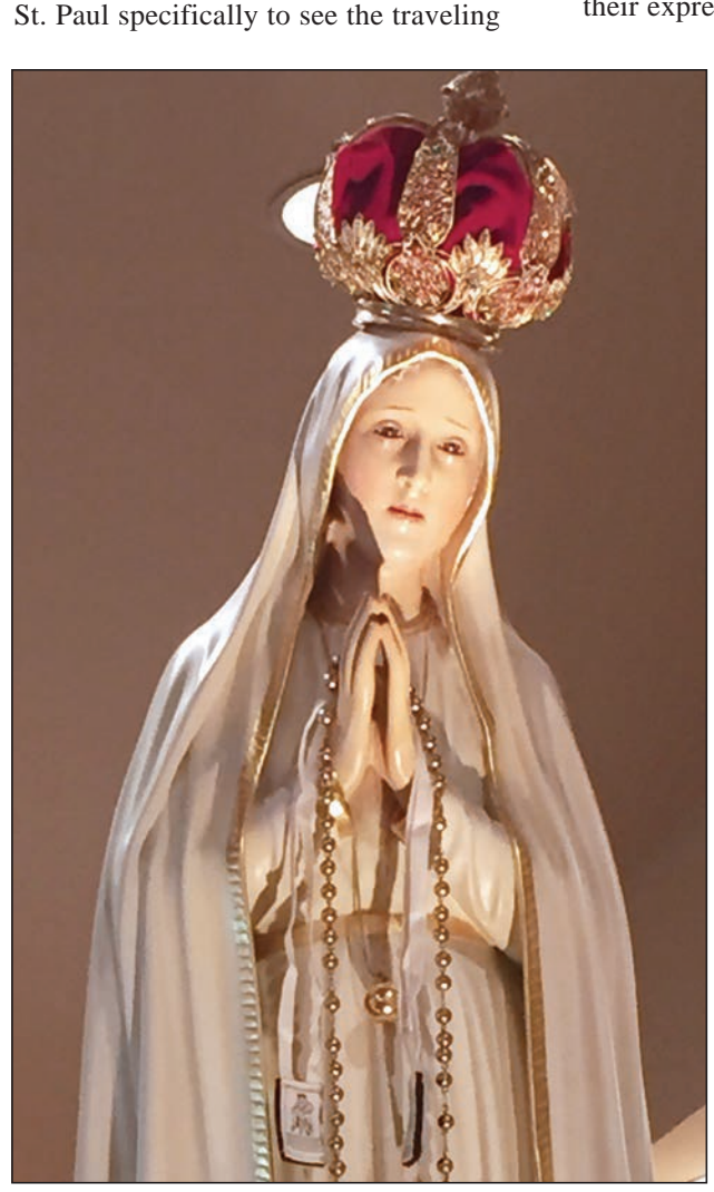
The traveling pilgrimage statue of Our Lady of Fatima is illumined in St. Paul Church in Sellersburg on Aug. 21. The statue, a duplicate of the one at the shrine of Our Lady of Fatima in Portugal, was commissioned in 1947 to travel the world, sharing the message of Our Lady of Fatima, who appeared six times to three shepherd children in 1917.

(For more information on the pilgrimage statue of Our Lady of Fatima's Tour for Peace, including a list of upcoming locations and information on the message conveyed in the Fatima apparitions, log on to www.fatimatourforpeace.com.) †