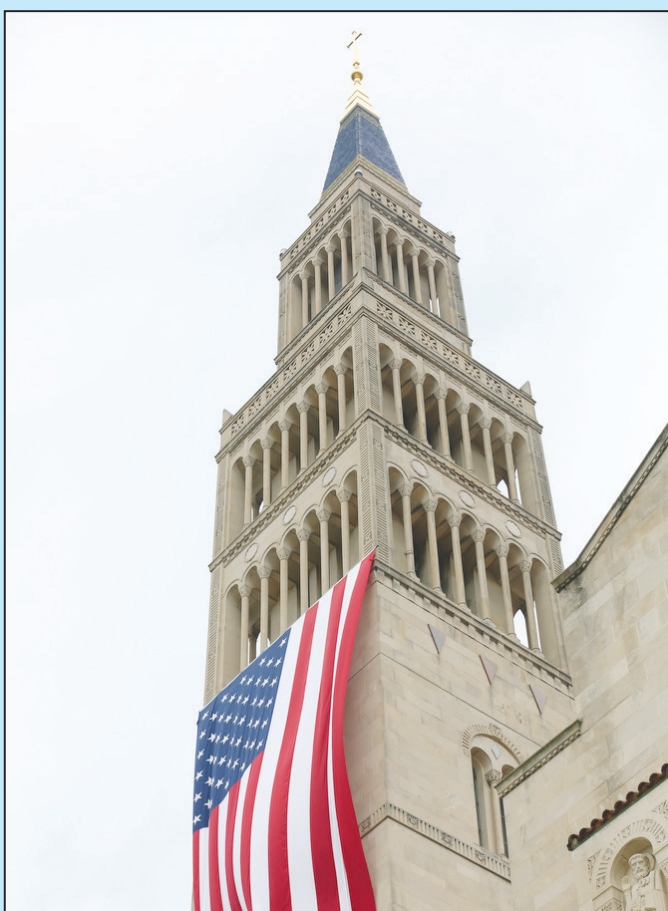
A large American flag is seen hanging from the bell tower of the Basilica of the National Shrine of the Immaculate Conception in Washington on July 4, 2015. The U.S. bishops' fifth annual Fortnight for Freedom runs from June 21-July 4.