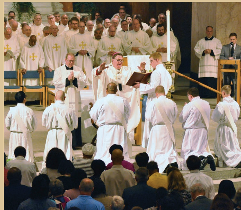
With more than 100 priests looking on, Archbishop Joseph W. Tobin prays a prayer of consecration over the six transitional deacons he ordained to the priesthood during the June 25 ordination Mass.