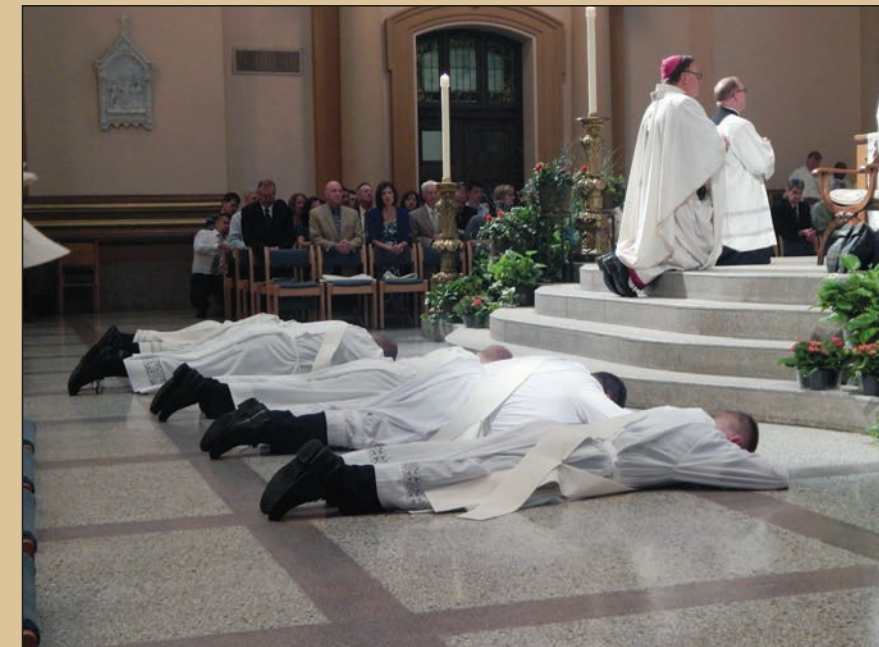
Six transitional deacons lie prostrate in prayer on the floor of the cathedral during the June 25 ordination Mass, minutes before they were ordained priests.