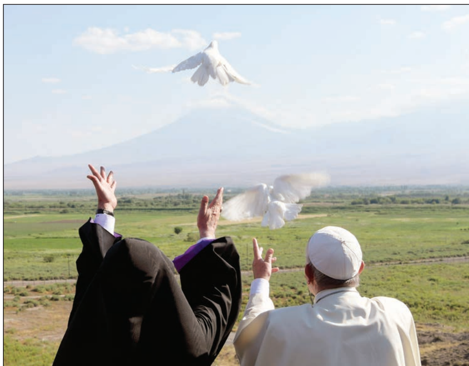
Pope Francis and Catholicos Karekin II, patriarch of the Armenian Apostolic Church, release doves from the Khor Virap monastery near Lusarat village in Armenia on June 26. In the background is Mount Ararat, believed to be where Noah’s Ark came to rest.

For centuries, the Oriental Orthodox were regarded by the rest of Christianity as adhering to a heretical teaching on the nature of Christ, but recent scholarship has led theologians and Church authorities on both sides to affirm that the Christological differences were not doctrinal. Rather,