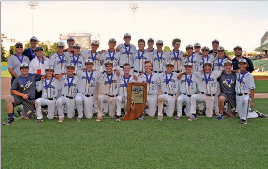
Members of the baseball team of Our Lady of Providence Jr./Sr. High School in Clarksville are all smiles as they pose for a photo after winning the Class 2A Indiana State High School Athletic Association championship on June 18 at Victory Field in Indianapolis.