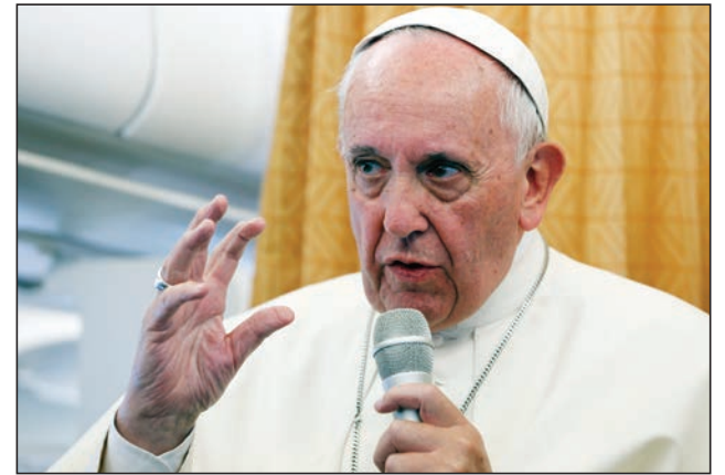
Pope Francis answers questions from journalists aboard his flight from Yerevan, Armenia, to Rome on June 26.