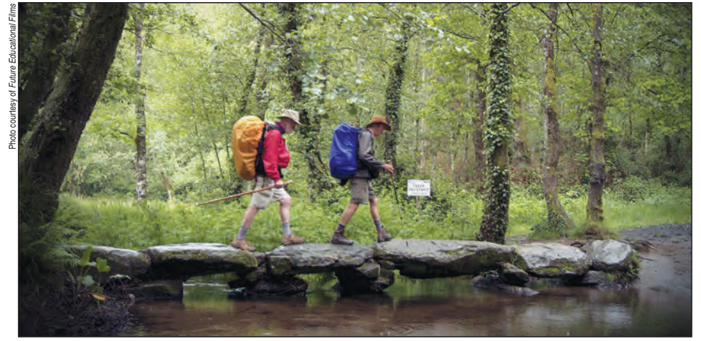
Two pilgrims profiled in Walking the Camino: Six Ways to Santiago walk across a stone bridge on an ancient pilgrimage path in northern Spain. The documentary will make its Midwest premiere later this month as a part of the Heartland Film Festival in Indianapolis.

She said that she hopes viewers of the documentary will walk away from it having