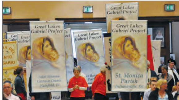
Banners representing various parish pro-life ministries lead the opening procession at the Respect Life Sunday Mass at SS. Peter and Paul Cathedral in Indianapolis on Oct. 6.