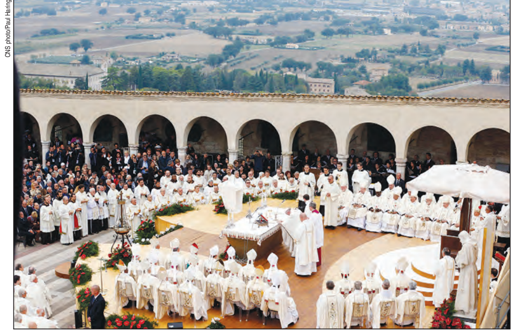
Pope Francis celebrates Mass in the piazza outside the Basilica of St. Francis in Assisi, Italy, on Oct. 4.

The pope's day in Assisi included visits to various sites associated with St. Francis, including his tomb in the Basilica of St. Francis; the Church of San Damiano, where the saint had a vision of Jesus; the hermitage where he went to pray in isolation; the small "Porziuncola" church, now contained inside the Basilica of Santa Maria degli Angeli, where he founded the Franciscan order; the tomb of his friend St. Clare; and the cathedral where St. Francis and St. Clare