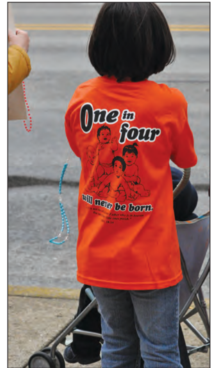
A child praying during the Life Chain on Meridian Street in Indianapolis on Oct. 6 wears an orange shirt sold by Central Indiana Life Chain for the Respect Life Sunday event. The shirt states the somber fact that “one in four babies will never be born.”