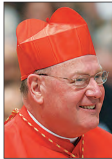
Cardinal Timothy M. Dolan

RYE, N.Y. (CNS)—The three most recent popes exemplify the soul, head and heart of religion, Cardinal Timothy M. Dolan of New York told an interfaith group on Sept. 29.