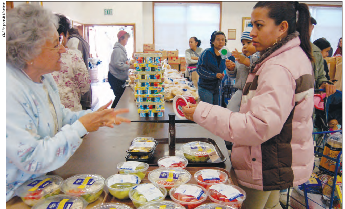
A volunteer helps local residents select food at the pantry open once a week at St. Margaret Mary Alacoque Parish in the Los Angeles suburb of Lomita. Catholics give witness to Christ by being living examples of his teaching, including his call to care for those in need.

Martyrdom—that most heroic form of faithful witness—is not entirely a thing of the past. For example, in