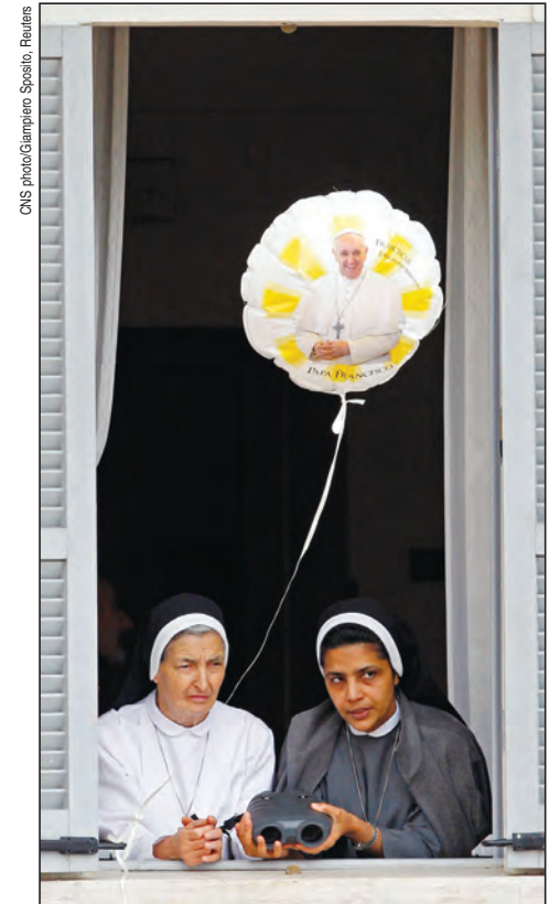
Nuns watch from a window as Pope Francis celebrates Mass in the Italian town of Assisi on Oct. 4. The pontiff was making his first pilgrimage as pope to the birthplace of his papal namesake.

"I always advise newlyweds: 'Argue as much as you want,'" he said. "If the plates fly, let them. But never let the day end without making peace, never." †