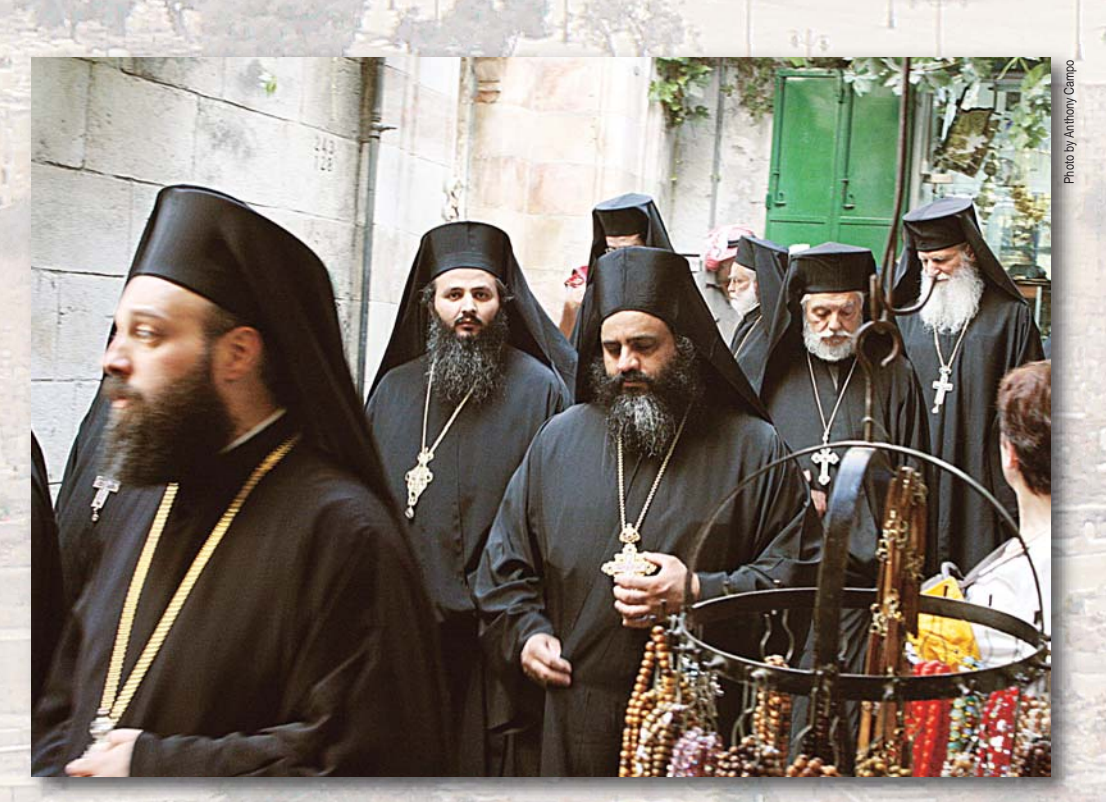
A procession of Armenian priests celebrating the Exaltation of the Cross walk along the streets of Jerusalem.