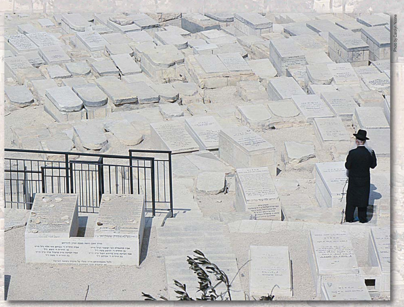
A man prays in front of a tomb in a Jewish cemetery near the old city in Jerusalem.