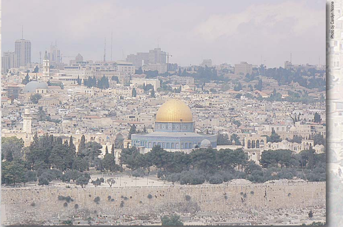
The Dome of the Rock, a Muslim shrine, accents the old city of Jerusalem.