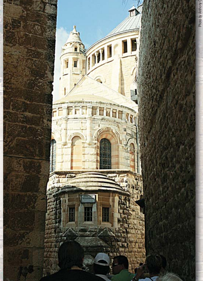
The Upper Room is where Christ instituted the Eucharist, sharing his last meal with the disciples.