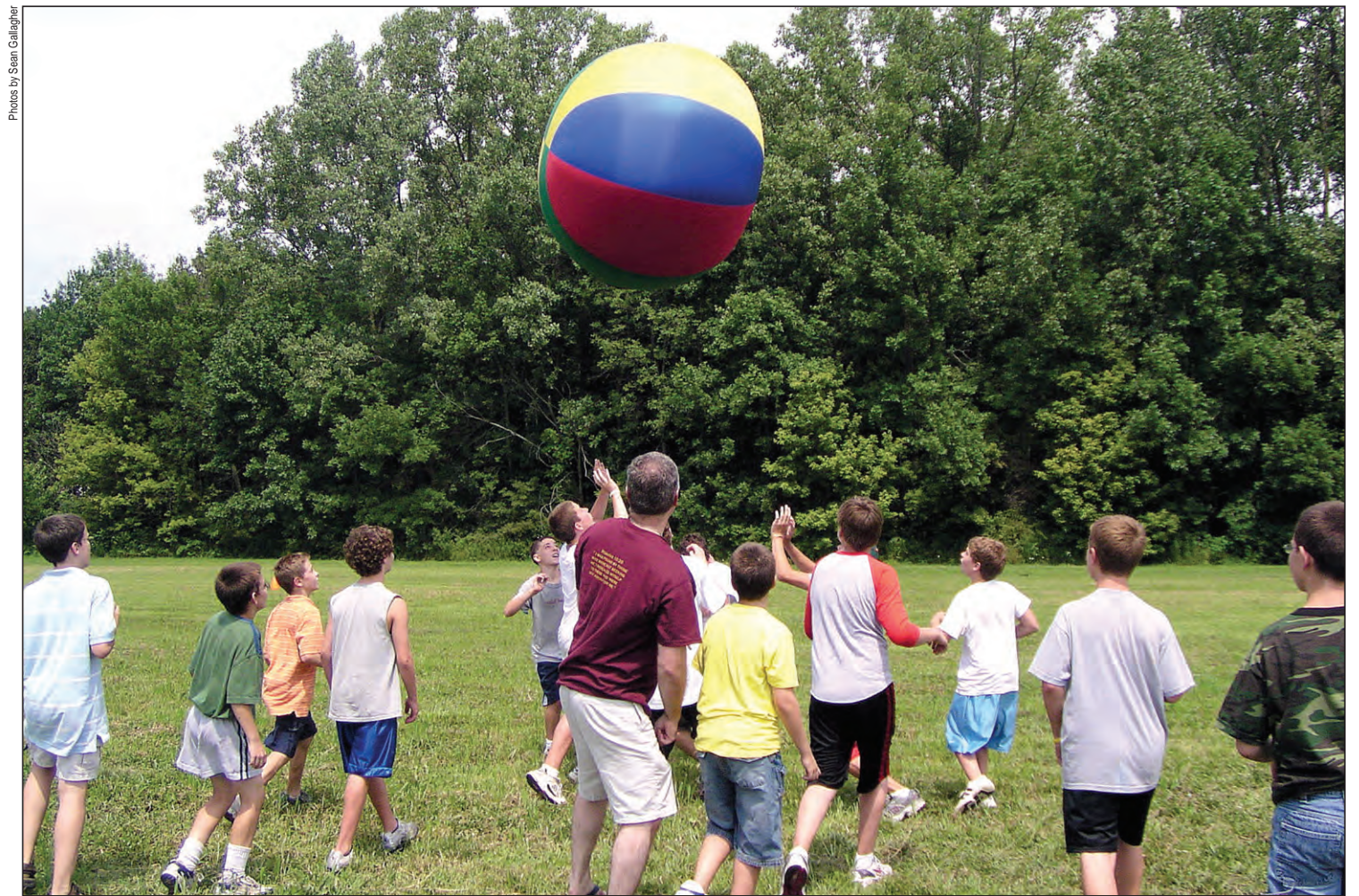
A group of boys play a game of "push ball" on Aug. 4 at Our Lady of the Apostles Family Center in Hancock County during E6, a vocations camp sponsored by Our Lady of the Greenwood Parish in Greenwood.